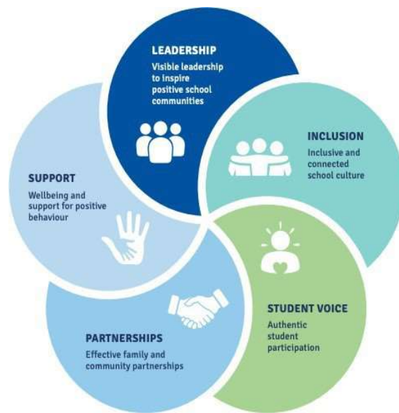
Figure 1: The five key interconnected elements of the Australian Student Wellbeing Framework